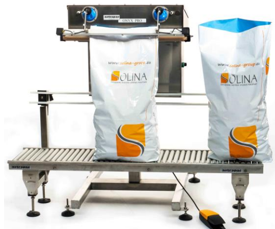
TYPICAL GRAVITY ROLLER CONVEYOR OPTION ALSO SHOWN SELF LEVELING FEET OPTION

Motorised belt conveyor with stop/start operation via a foot switch. assists the operative in presenting a regular supply of heavy bags to the sealer.