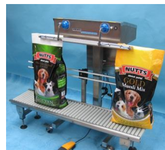
EXAMPLE Gravity roller and motorised conveyor belt conveyor designed to suit application.

* Motorised belt conveyor with stop/start operation via a foot switch.